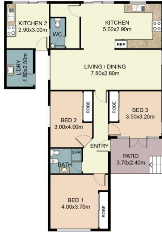
F L O O R P L A N