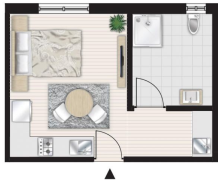
FLOOR PLAN 1:100