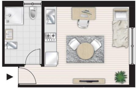
FLOOR PLAN 1:100