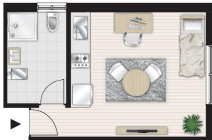
FLOOR PLAN 1:100