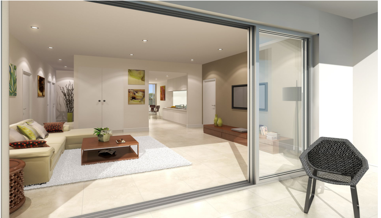
The Tennyson 100 TENNYSON ROAD MORTLAKE